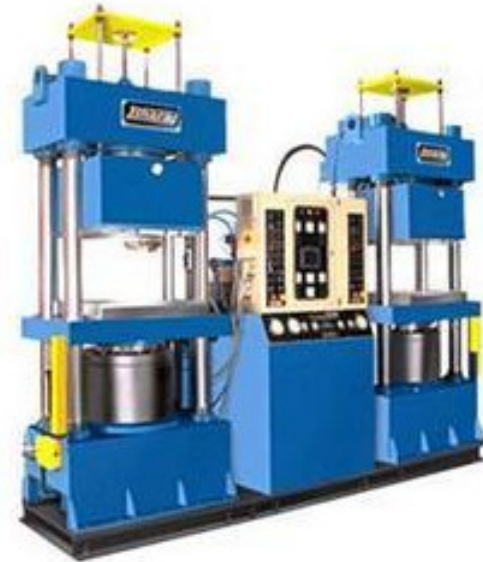
Machine: Hydraulic Press

Process: Transfer Moulding, Compression Moulding Compounding