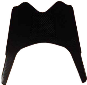
2 Wheeler Rubber Mat